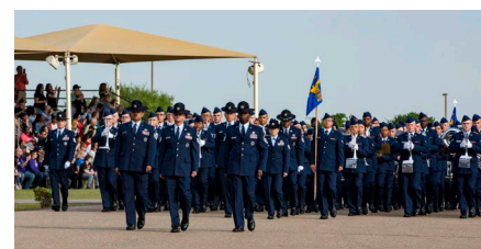
Welcome sign to JBSA-Lackland (top). Airmen and military training instructors march in a basic military training graduation parade (bottom).